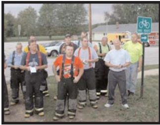
Police, Fire, Sheriff and EMS personnel arrive and listen to the presentation at the Peru Center Road Trailhead in Monroeville. Many of them are regular runners and bikers on the NCIT.

Twenty Three members of local police, fire, sheriff and EMS were present at the Safety Forces Day event on the trail on September 15 in Monroeville.