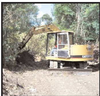
Joe Wilhelm was hard at work preparing the new trail surface as we went to press. A finished trail will await you on Oct 19!

1.3 Miles of beautiful new trail now open!