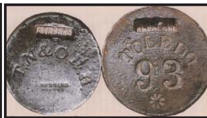
Artifacts and photos from the early TN&C days are almost impossible to find. The photo above (near actual size) shows the front and back of a TN&C baggage tag. Map shows original TN&C line going to Grafton and later Elyria. Map from May 1984 Mainline Modeler.