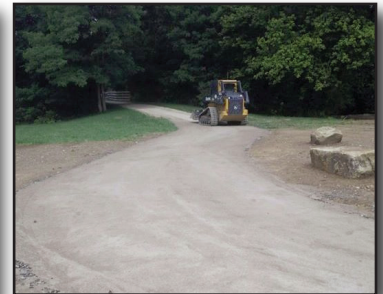
Soon after the S-Curve of the connector was installed, volunteers cleaned the bridge deck and sealed the railings. Seeding of the adjacent landscape will follow.

Wakeman has the connections! And is quickly becoming a true trail Destination!